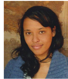
Some of our current scholarship recipients