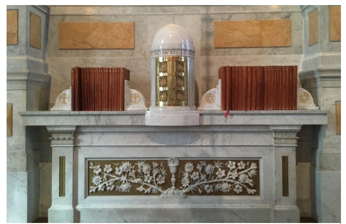
The Altar Bible and Tabernacle are a tangible reminder of the twin pillars of Word and Sacrament.

When the Bible was printed, St. Vincent commissioned 250 sets of prints of the nine illuminations. We still have some available. They are $25 each or $150 for the set. To purchase, contact the parish office at <a href="mailto:parishoffice@stvchurch.org">parishoffice@stvchurch.org</a>.